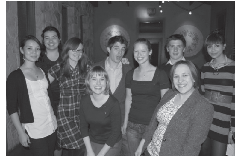
Alumni Dinner December 2008